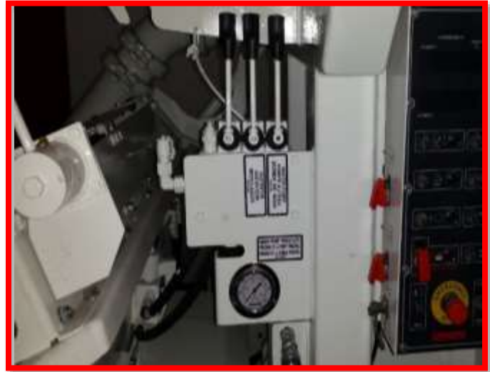
Detachable Placing Boom Model Shown